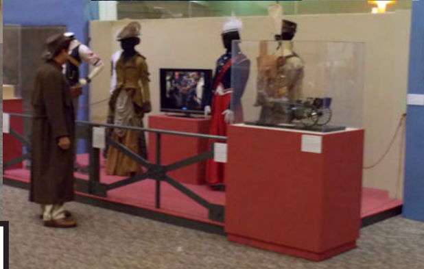
SWCG Field Trip to Steampunk An Exquisite Adventure November 24, 2013